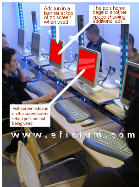
Figure 1. Advertising spaces offered by Dynasoft Cybercafe SurfShop Free on the client pc's

Figures 1 and 2 show where these ads are displayed in a typical cybercafe configuration.